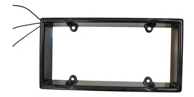
License Plate Frame Antenna (patented)

The CLP Series License Plate Frame Antenna from Mobile Mark accommodates multiple antennas in one package. This patented design feature antenna elements that are actually hidden away inside the license plate frame.