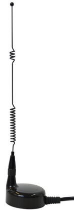
Magnet Mount Model MGX