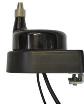
Trunk Lip Mount Option SM-TM

This antenna is the ultimate in high gain performance for AVL/tracking applications with a permanent hole mount. This TriBand Surface mount provides operation on GSM, CDMA or Trunking 800 bands along with GPS. The GPS antenna has an active amplifier for maximum satellite reception.