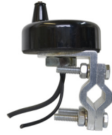
Mirror Mount Option SM-MM