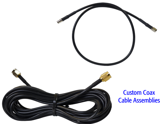
Custom Coax Cable Assemblies