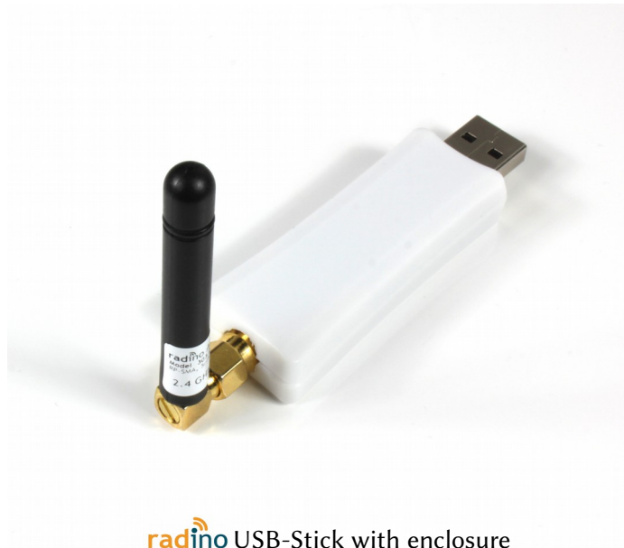
radino USB-Stick with enclosure