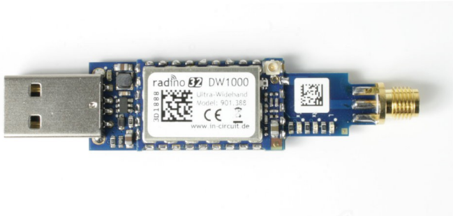
Top View (with radino 32 DW1000)