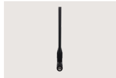
WIFI 6E RUBBER DUCK ANTENNA