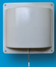
PN10 Series Panel Antenna Long-range coverage RFID, 868 or 915 MHz 10 dBic gain