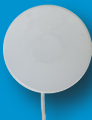
DLM & DLT Series Dual-polarity Patch Wall mount or Tape mount RFID, 868 or 915 MHz 3 dBi gain (same profile for NLM Nearfield Loop)