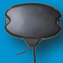
CVO Series Patch Antenna Impact resistant/Linear Pol. RFID, 868 or 915 MHz 2.5 dBi gain