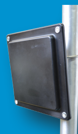
HD7 Series Heavy-duty Panel Antenna shown with Pole Mount RFID, 868 or 915 MHz 7 dBic gain