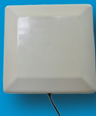
PN8 Series Panel Antenna Mid-range coverage RFID, 868 or 915 MHz 8 dBic gain