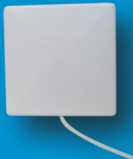
PN6 Series Panel Antenna Left or Righthand Circularly Polarized RFID, 868 or 915 MHz 6 dBic gain