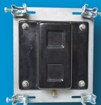
PN7 Series Fork-lift Panel Antenna shown with Back Plate Mounting Kit RFID, 868 or 915 MHz 7 dBic gain