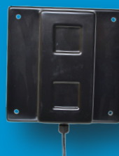
PN7 Series Fork-lift Panel Antenna Direct-N or Pigtail termination RFID, 868 or 915 MHz 7 dBic gain