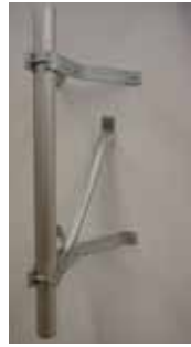
Universal Wall Mount 12" Standoff