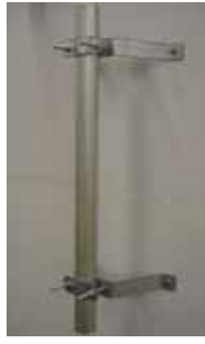
Universal Wall Mount 4" Standoff