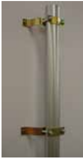
Universal Wall Mount 2.5" Standoff