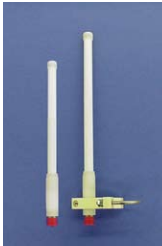
ECO Series 2.4 - 5 GHz Models with N female