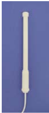
"PT" pigtail cable option for all models